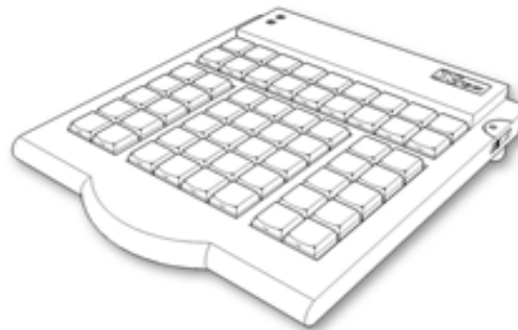
Professional 58 Keys